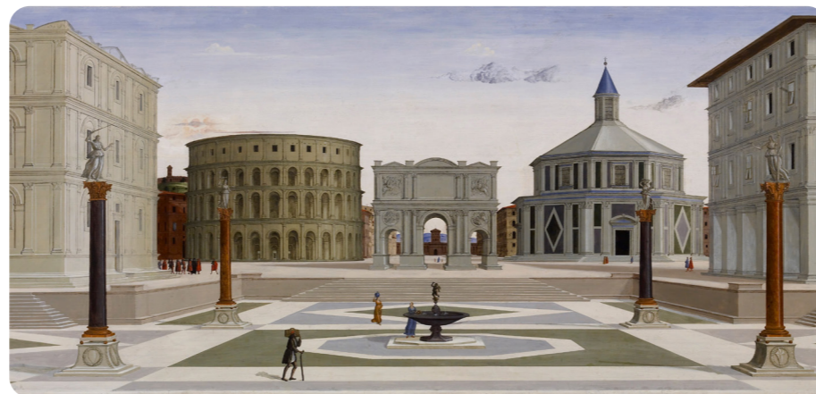
The Ideal City by Fra Carnevale, c1480–1484

Urban landscapes are drawings of towns and cities shaped by the people and buildings found there. Different atmospheres are created using bright, dark or muted colours and sharp or blurry lines.