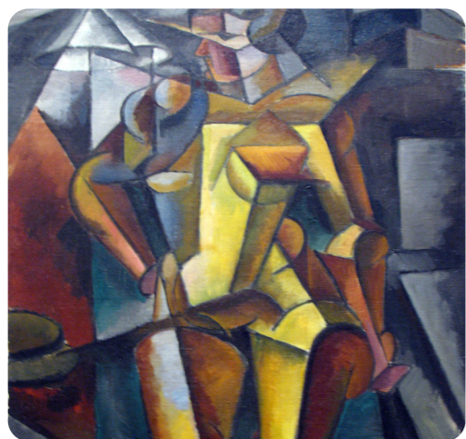
The Model by Lyubov Popova, 1913