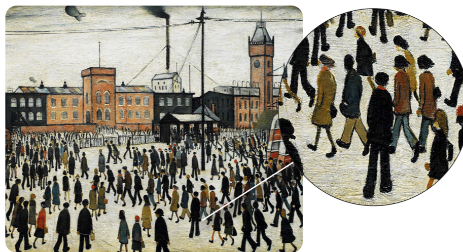
Going to Work by LS Lowry, 1959