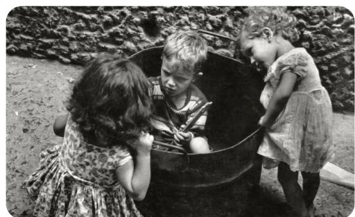
Naples, Italy – Children by Herbert List, 1961